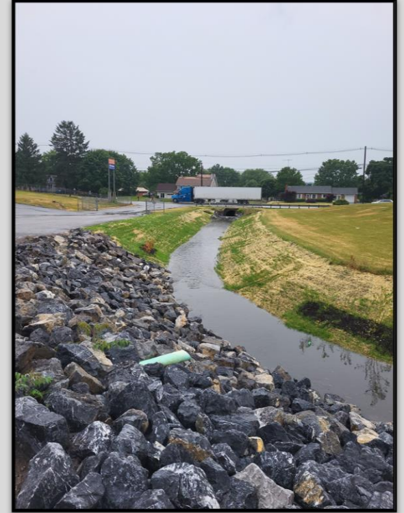
South Main Street Stormwater BMP Implementation Project