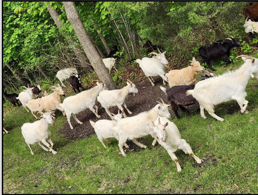
FlockWorks Guided Goat Grazing