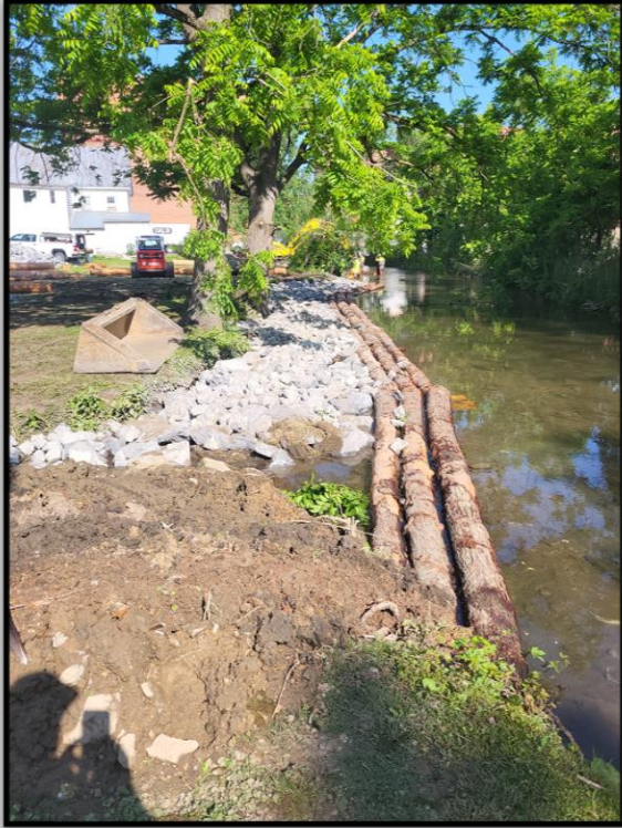
Falling Spring Streambank Restoration Project